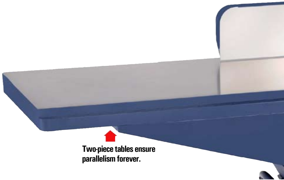
Two-piece tables ensure parallelism forever.