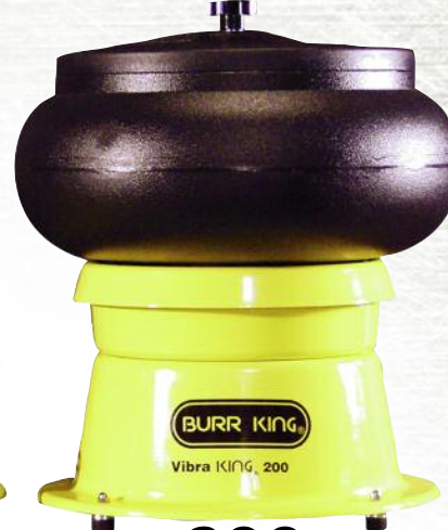
200 20000-1 shown

Burr King vibratory bowls are ideal for bench top polishing, descaling, deburring, and surface conditioning. Units are fast, quiet, and effective. Available in 3 qt, 10 qt, 20 qt, and 40 qt volumes.