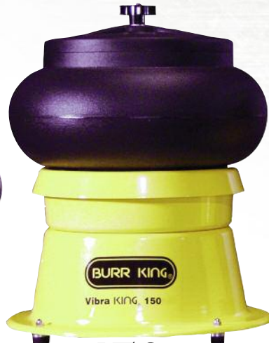
150 15000-1 shown