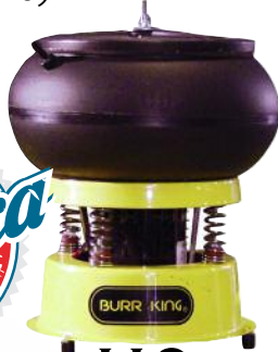
110 11000 shown